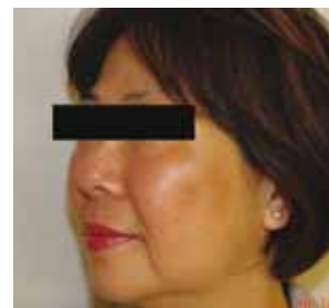
Three months AFTER 2 MiXto laser treatments