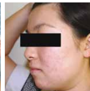
7 days post MiXto laser