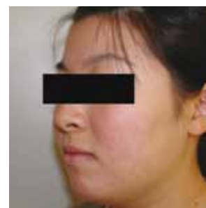
5 months post MiXto laser