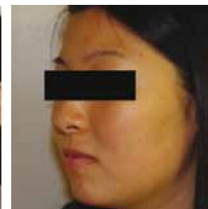
15 months post MiXto laser