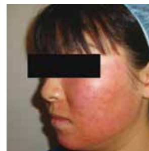
Immediately post MiXto laser treatment